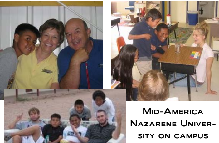
MID-AMERICA NAZARENE UNIVERSITY ON CAMPUS

This year so far, we have received $3,075 from Labels for Education , and we have sent in 330,065 Campbell's Soup labels (We now have 849,215 toward the 1,600,000 we need for a van.) Thank you and God bless you for your faithfulness.