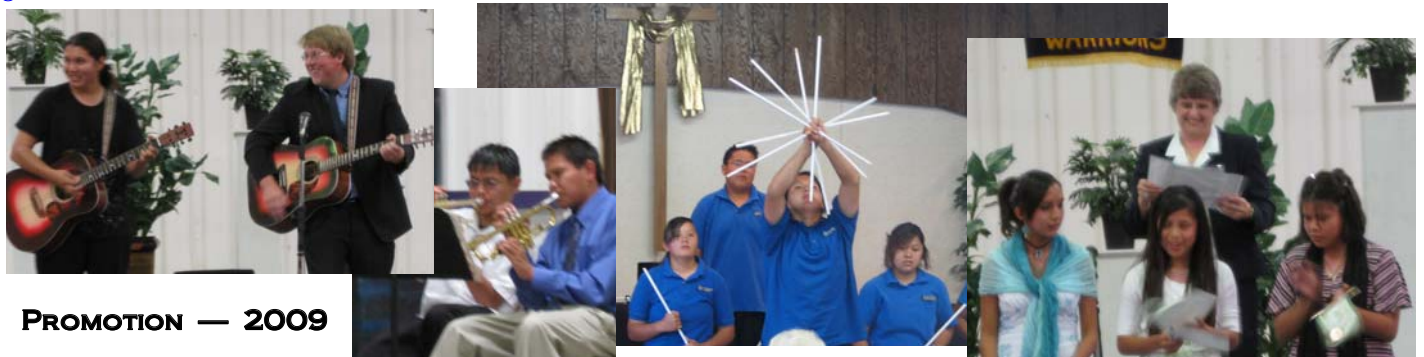
PROMOTION — 2009